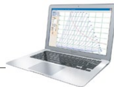
PC or PLC interface