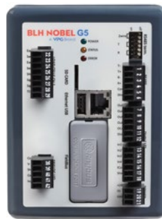
G5 DIN-rail Mount